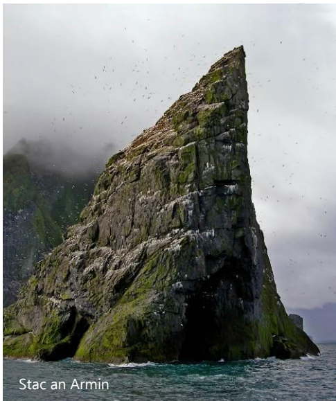
Stac an Armin

For many the undoubted highlight of this cruise will be our time exploring the St Kilda group, Britain's first World Heritage Site designated for its spectacular seabird colonies and amazing scenery, including the highest sea cliffs and stacks in the British Isles (the cliffs at Conachair are 425 metres high!). The St Kilda group is the eroded remains of huge volcano and made up of three main islands Hirta (the largest of the archipelago), Boraray and Soay. They are home to half a million pairs of breeding seabirds including the second largest Gannetry in the world (recently demoted in favour of Bass Rock!) with over 60,000 pairs, whilst the 60,000 pairs of Fulmar represent the largest colony of that species in Britain. Most remarkable of all, 25% the British Puffin population - an incredible 150,000 pairs! - nest on St Kilda, as do 90%