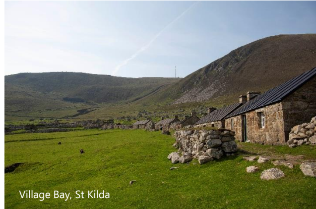
Village Bay, St Kilda

By early afternoon, if the weather is clear, we will be able to see the silhouette of St. Kilda on the horizon. Although it may look tantalising close, it is still several hours away, giving us plenty of time for more wildlife spotting. Your tour leader will be monitoring the seas closely from the bow or the wheelhouse for any wildlife that may show up and you are very welcome to join them ... the more eyes the better!